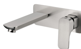
Brushed Nickel PSR3006SB-BN