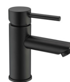
PC2003SB-B Matt Black