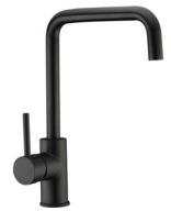
PC1002SB-B Matt Black