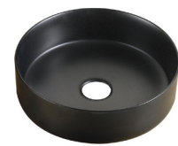
Matt Black LTI-22-401MB