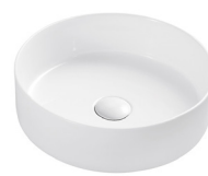
Matt White LTI-22-401MW